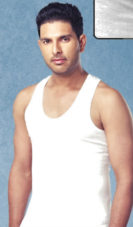
POLO Rib Vest

Made from 1 x 1 Rib fabric for the finest fit. A perfect blend of comfort and style.