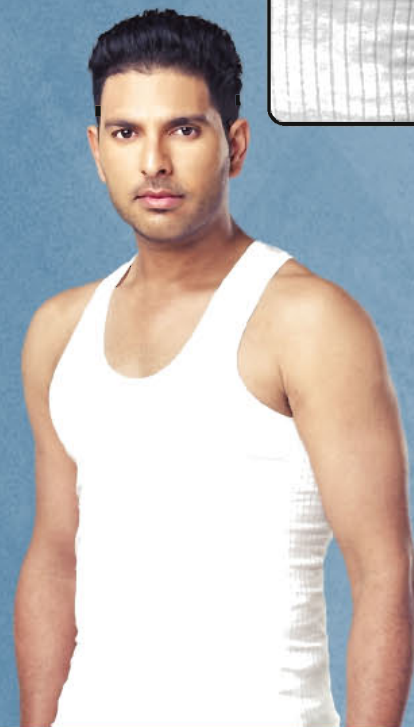
ROMEO Parker Vest

Drop needle fabric for the superior fit. Superb finish gives body hugging feel with a dash of style.