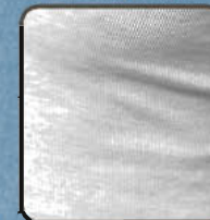
1x1 Rib Fabric

Sizes Available: S-80, M-85, L-90, XL-95, XXL-100