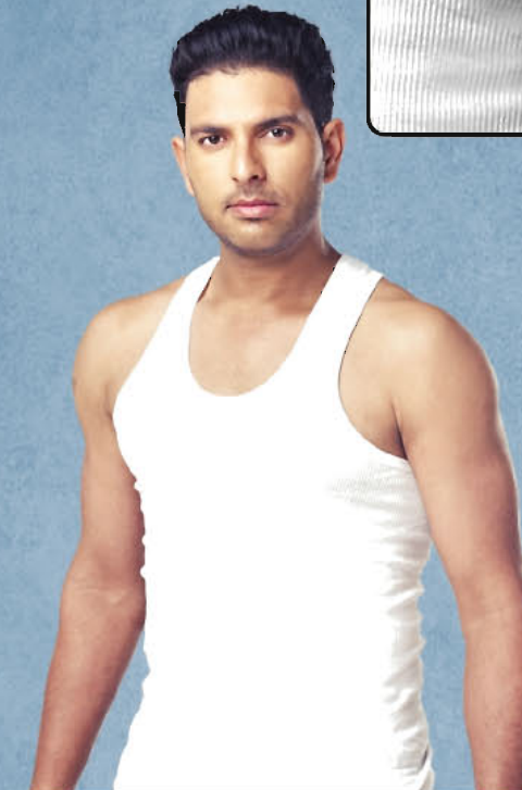
DERBY Rib Vest

Made from 2 x 2 rib fabric for the body hugging feel. Great fit and finish adds up to unmatched comfort.