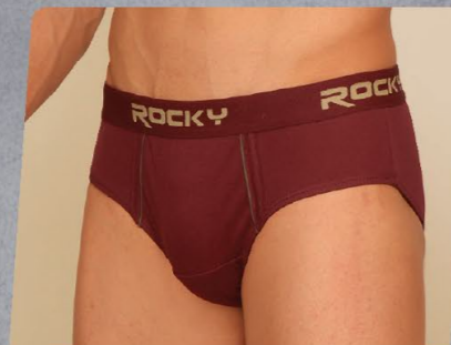
JAZZ Outer Elastic

A stylish blend of brief and long trunk. Superior elastic with trendy looking waistband.