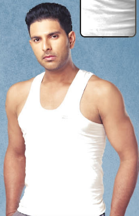
U. V. ARISTO Fine Vest

100% super combed cotton for the ultimate comfort. Superior fit and finish to give perfect body shape.