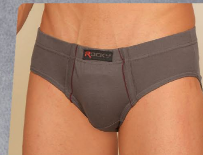
JAZZ Inner Elastic

Hip and leg coverage for superior comfort. Premium quality elastic with stylish waistband.